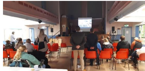
St Andrew's, Skipton