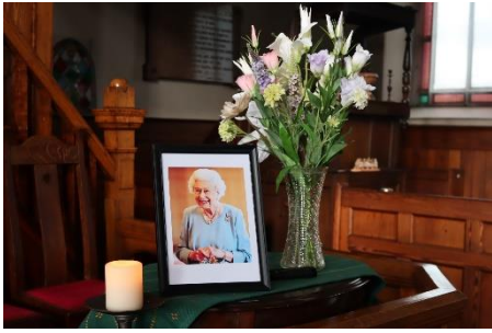
Heywood Chapel, Northowram

The news a fortnight ago of the passing of Queen Elizabeth II came just after the last issue of The Briefing was published. Fortunately Synod was able to call upon our Churches to bring to our collective notice of where places of prayer were possible, where books of condolences were available and which churches were able to broadcast the funeral on 19 th September. I know I will have missed a few churches who have opened their doors in response to