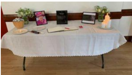
Bolton Villas Family Church

Elizabeth II's death, but the response of those whose efforts were recorded on the Synod website at Latest News - URC Yorkshire Synod was amazing. Thank you all, and I pray that by