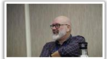
Something must have been funny.