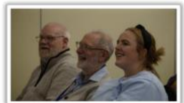
Yorkshire folk have smiles all round!