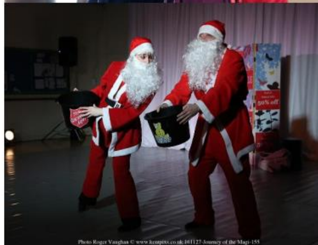
101127-Journey of the Magi-153